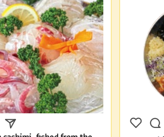
O O A The fresh sashimi, fished from the blue waters of the East Sea, attracts many people's taste buds. There are many sashimi restaurants at Jujeon Mongdol (Pebble) Beach, Ilsan Beach, Seuldo Island, and Bangeojin Port. The sashimi eaten while watching